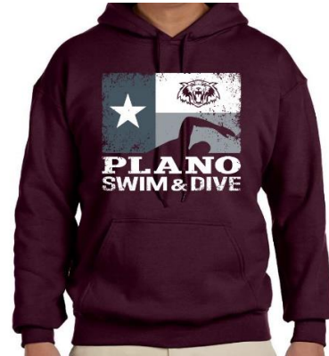
Heavy-Blend Pullover Hoodie $25.00