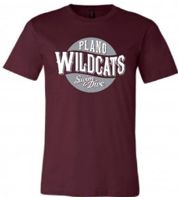
100% Cotton Light Semi-Fitted Tee $20.00