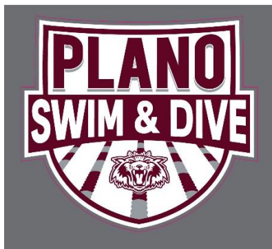
5" Decal (gray not on decal)