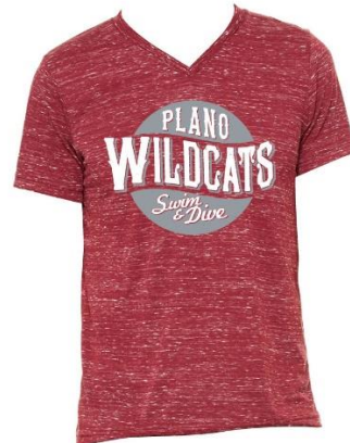
100% Cotton V-Neck Tee, Maroon Marble $25.00