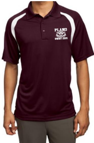
Sport Tek Polo $35.00

Orders will be taken at Parent Meeting on September 6