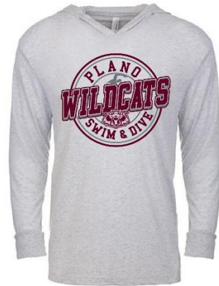
Tri-Blend Hoodie, Vintage White $30.00