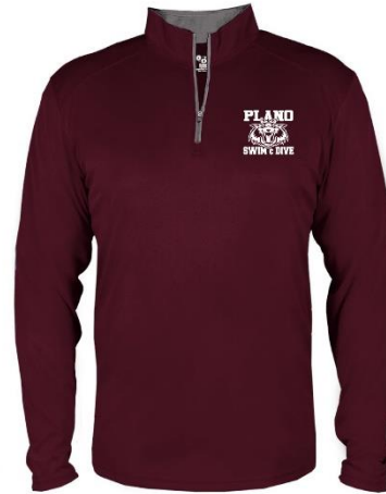
Lightweight ¼ Zip Pullover $38.00