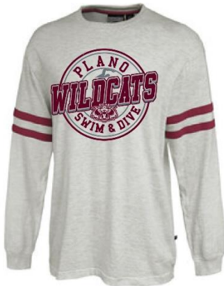
100% Cotton Vintage Stripe Jersey $30.00