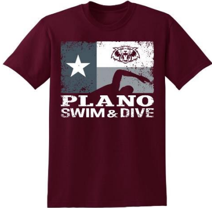
Gildan Heavy 100% Cotton Tee $15.00

Orders will be taken at Parent Meeting on September 6